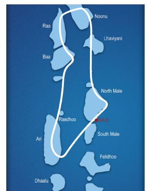
Predicted route around the north & central atolls.

Differing from other Manta Expeditions, on this trip we aim to dive almost exclusively with mantas, carrying out long surveys on both cleaning and feeding sites in order to gather novel in-depth data on site utilisation, cleaning and feeding behaviour.